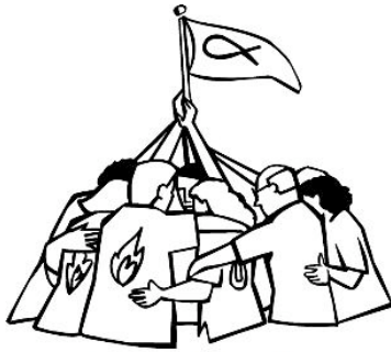
Church Planning Retreat

Our 2010 Church Planning Retreat for all Administrative Council and Committee Members is scheduled for Saturday, January 9, 10:00am to 2:00pm here at FUMC, The Colony.